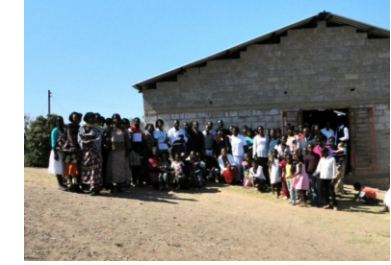
Tabernacles in Bauleni and Chilanga after the walls were put up