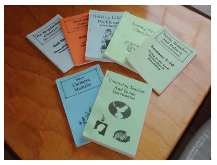
A few of the set of 18 Christian Service books

Leaders studying Christian service books in various centers around Zambia